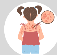
Eczema & Poison Ivy