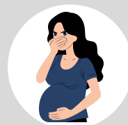
Vomiting in Pregnancy